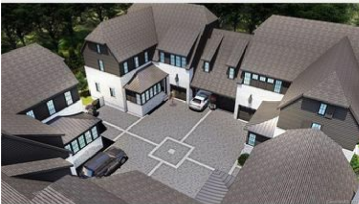
Introducing Kings Square... an enclave of Four European style duet townhomes in the heart of historic Myers Park. Offering lavish interiors, included elevators, and open floorplans these homes are